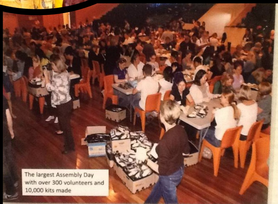
The largest Assembly Day with over 300 volunteers and 10,000 kits made